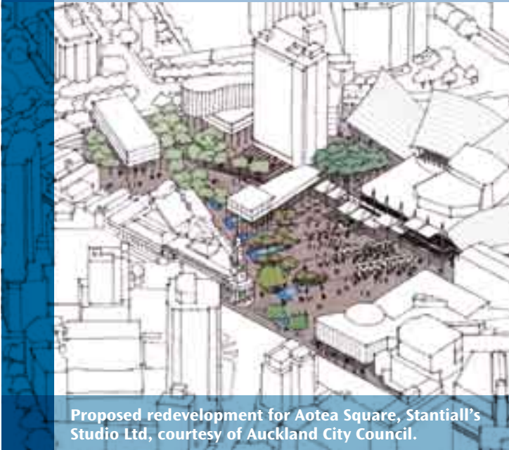
Proposed redevelopment for Aotea Square, Stantial's Studio Ltd, courtesy of Auckland City Council.

Take a look at the University's online database of varied and exciting events available to members of the University community at www.vuw.ac.nz/events