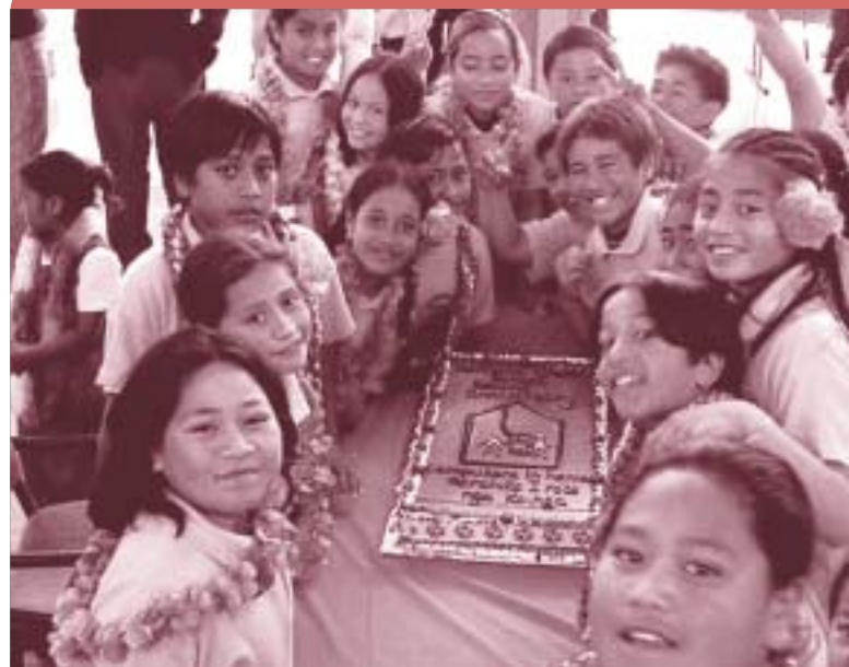
▲ Children from Cannons Creek School celebrate two years of Computers in Homes .