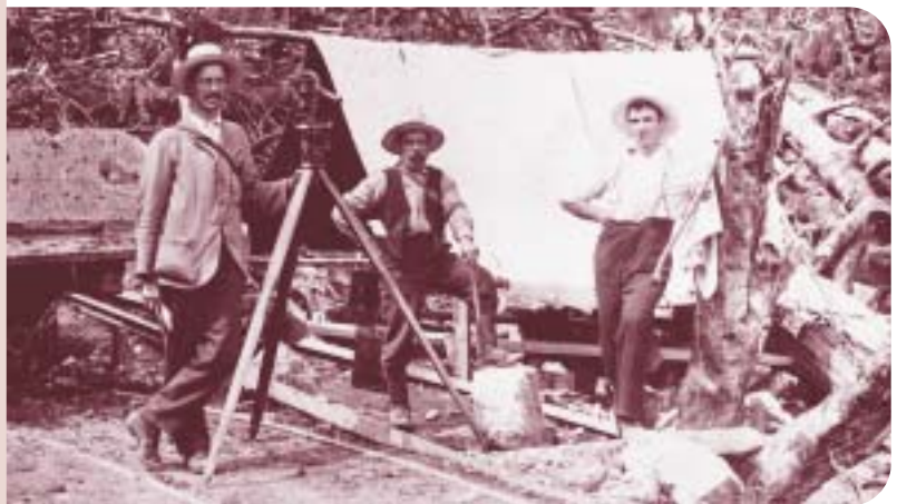
Alexander Turnbull Library

Giselle says the surveyors' work is all around us in place names and the straight lines that dominate our towns—often in defiance of the land's topography. The choice of names was often idiosyncratic. That the South Island has names such as Mt Cerberus and Mt Pisgah reflects surveyor James McKerrow's interest in Greek mythology and Biblical allusions.