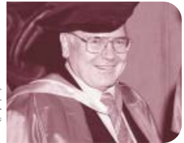
Photography by Woolf