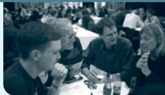
The Weapons of Maths Instruction competing for ▲ the inaugural University Challenge Quiz cup.