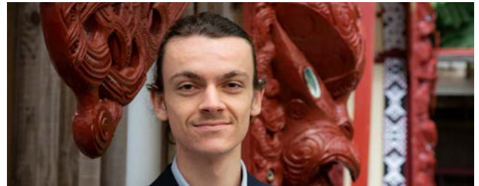
ŌRAUARIKI / VICTORIA BUSINESS SCHOOL