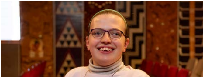
TE WĀHANGA ARONUI / FACULTY OF HUMANITIES AND SOCIAL SCIENCES