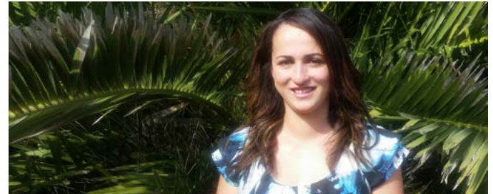
TE WHĀNAU O AKO PAI / FACULTY OF EDUCATION

This award is given to the top Māori undergraduate student in each faculty.*