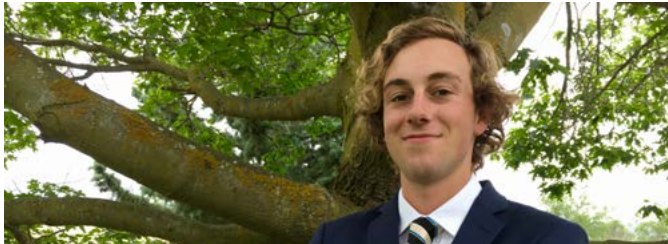
TE WĀHANGA WAIHANGA-HOAHOA / FACULTY OF ARCHITECTURE AND DESIGN